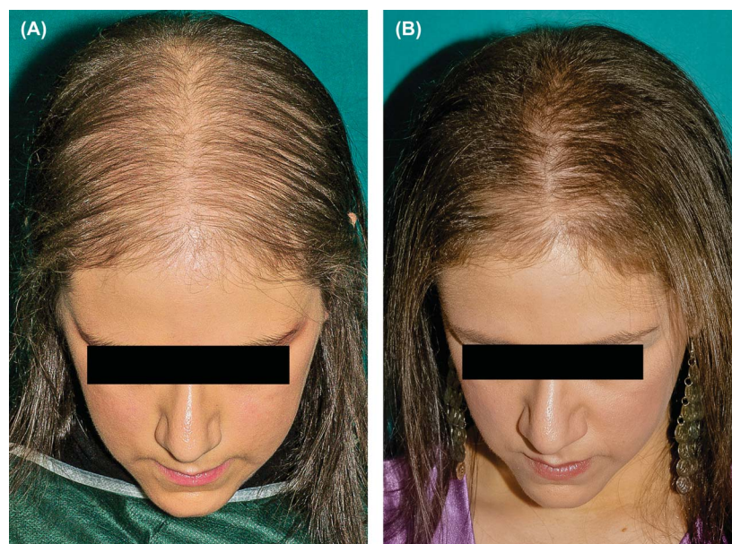
Figure 2. Baseline (A) and follow-up (B) condition of a 24-year-old patient. Preoperative platelet count 285,000 per microliter. Baseline GPA rated as “very severe,” rating of clinical change rated as +5 (i.e., “a good deal better”) by both evaluators.

4.1 (95% CI, 1.04–16.3) for “moderate” patients and 7.0 (95% CI, 1.2–41.1) for “severe and very severe” patients compared with the “very mild and mild”